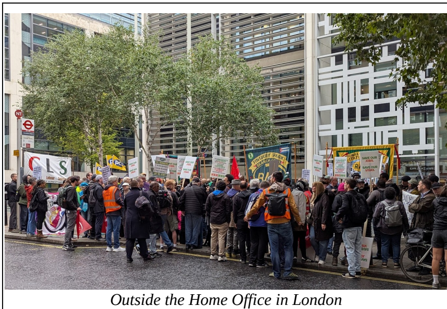
Outside the Home Office in London

On Wednesday 17th September, the RMT and PCS trade unions called a picket of the Home Office in London to protest at the threat to deport some of their members due to changes in the visa regulations. The government's sudden changes to skilled worker visa rules are an attack on all migrant workers. Nearly 200 Transport for London (TfL) and London Underground staff, many of them long-serving and unionised, now face deportation simply because their jobs have been reclassified as “unskilled.”