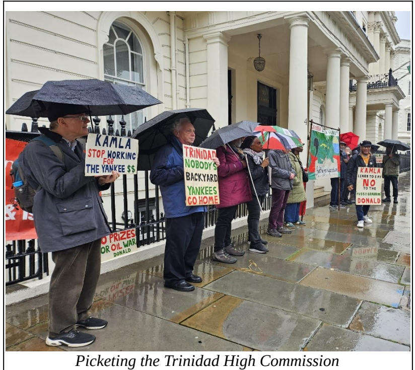
Picketing the Trinidad High Commission

It should be noted that on the 30th of June 1978, at the Tenth Special Assembly of the United Nations General Assembly, a Resolution was adopted which called for and authorized “the establishment of zones of peace in various regions of the world under appropriate conditions to be clearly defined and determined freely by the States concerned in the zone, taking into account the characteristics of the zone and the principles of the Charter of the United Nations and in conformity with international law.....”